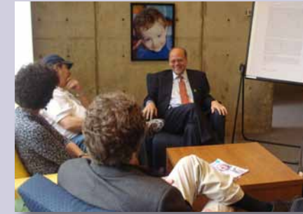
Congressman Cohen meets with staff of the Harwood Center to discuss pending disabilities legislation.

To learn more about these bills and other legislation, please visit cohen.house.gov or call (901) 544-4131.