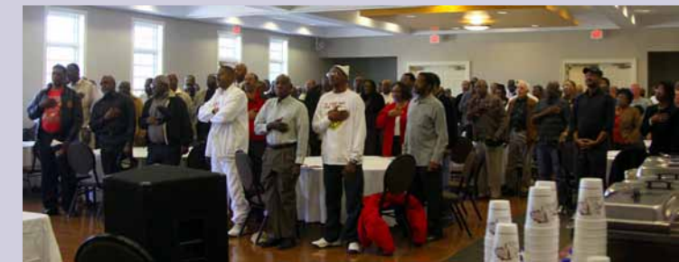
9th District veterans recite the Pledge of Allegiance before meeting with the Congressman to discuss veterans benefits and services.