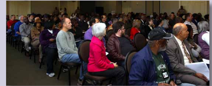
Several hundred constituents attended the Town Hall Meeting on federal funding for the 9th District, held at The Links at Whitehaven in November.