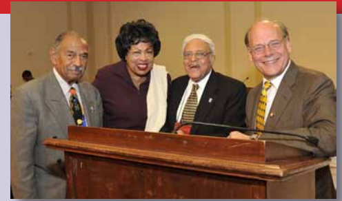
Congressman Cohen welcomes revered civil rights leader Dr. Benjamin Hooks to Capitol Hill for a briefing on civil rights legislation pending before Congress (from left to right Rep. John Conyers (MI), Rep Diane Watson (CA), Dr. Benjamin Hooks, Rep. Steve Cohen)