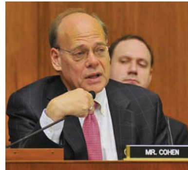
Congressman Cohen presiding as Chair of the Commercial and Administrative Law Subcommittee of the Judiciary Committee, which handles bankruptcy, among other issues.

In addition, the House has passed legislation to address the financial crisis by strengthening the oversight of Wall Street and cracking down on excessive CEO pay. H.R. 2765, the Libel Tourism Bill, which I authored and which passed the House, protects First Amendment rights.